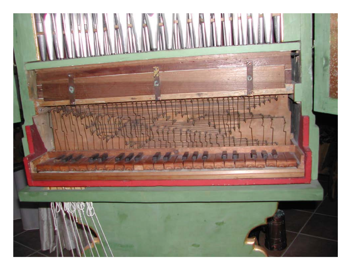
Original action, wind chest, attachment for pull down pedal board.