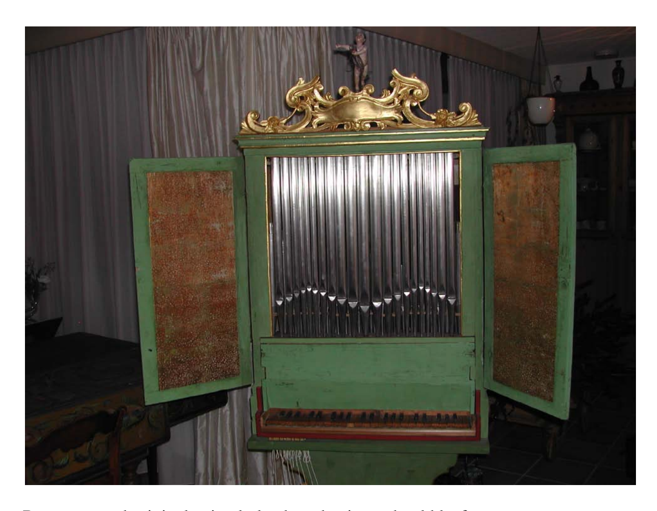
Reconstructed original animal glue based paint and gold leaf. Paneling covert with 18<sup>th</sup> century gold leaf printed decoration paper.