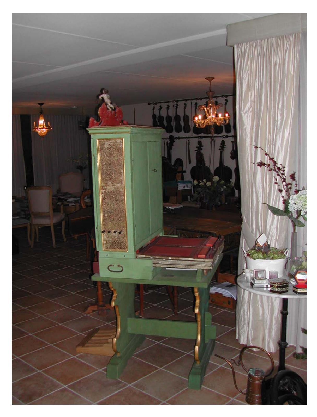
Original bellows, fantasy stand, reconstructed pedal board.